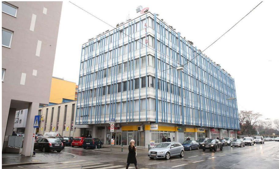
Main building of ATIB, Sonnleithnergasse 20, 1100 Wien, Austria

ATIB is the abbreviation of „Avrupa Türk-İslam Birliği“, Union of Turkey- Islamic cultural associations in Europe. ATIB sees itself as an umbrella of Islamic religious communities.